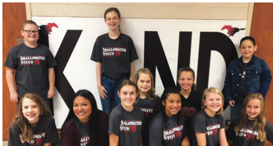
Right: Shallowater Middle School Team