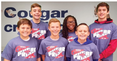
Above: Ed Irons Middle School Team