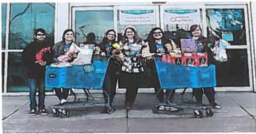
Members shopping for toys and treats for the shelter.

e. Community - People in the city of Pecos willingly donated to the Grand Companions Humane Society through outreach fundraisers like Caroling for Kittens. Pecos parents also brought their students to the Kidz Kamp.