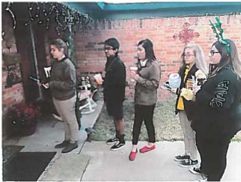
Members caroling at a house to raise money for the Grand Companions Humane Society.