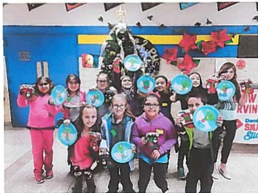
Elementary students showing off their crafts from Kidz Kamp fundraiser.