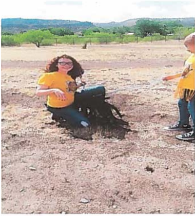
Members playing with and walking dogs at the shelter.