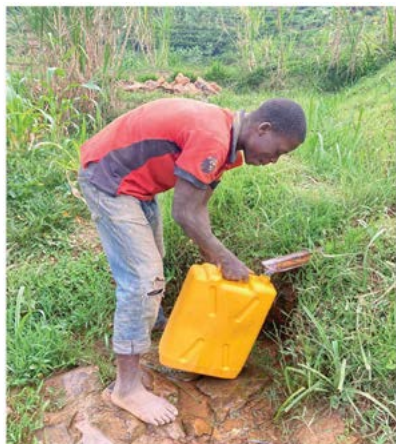
Old Water Source