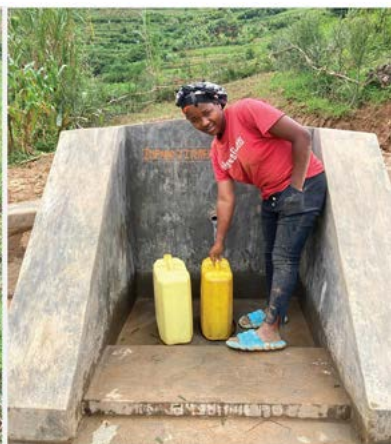
New Water Source