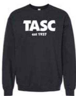
Gildan Softstyle Crewneck Sweatshirt