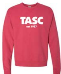
Comfortwash By Hanes Crewneck Sweatshirt