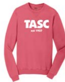
Port & Company Beach Wash Garment-Dyed Crewneck Sweatshirt