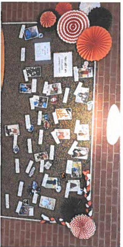
Class of 2019