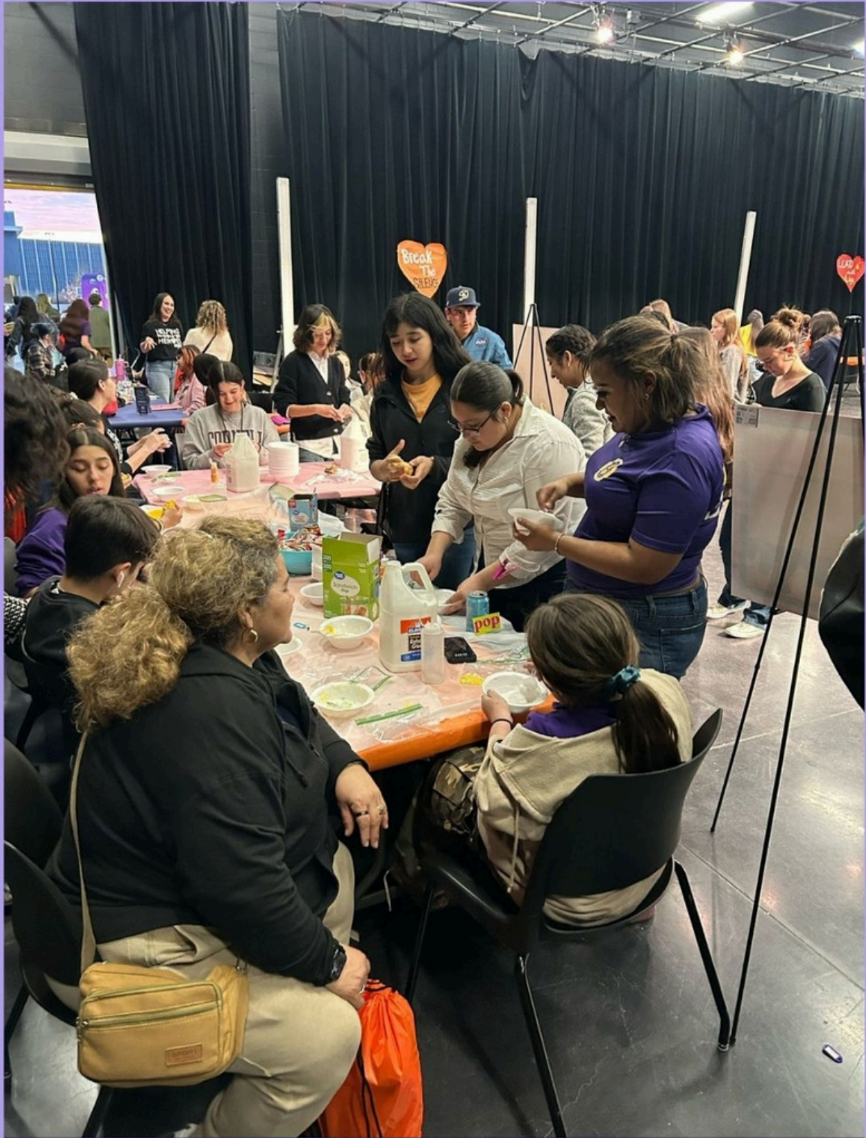
The Slime Making Booth manned by Mission Early College High School