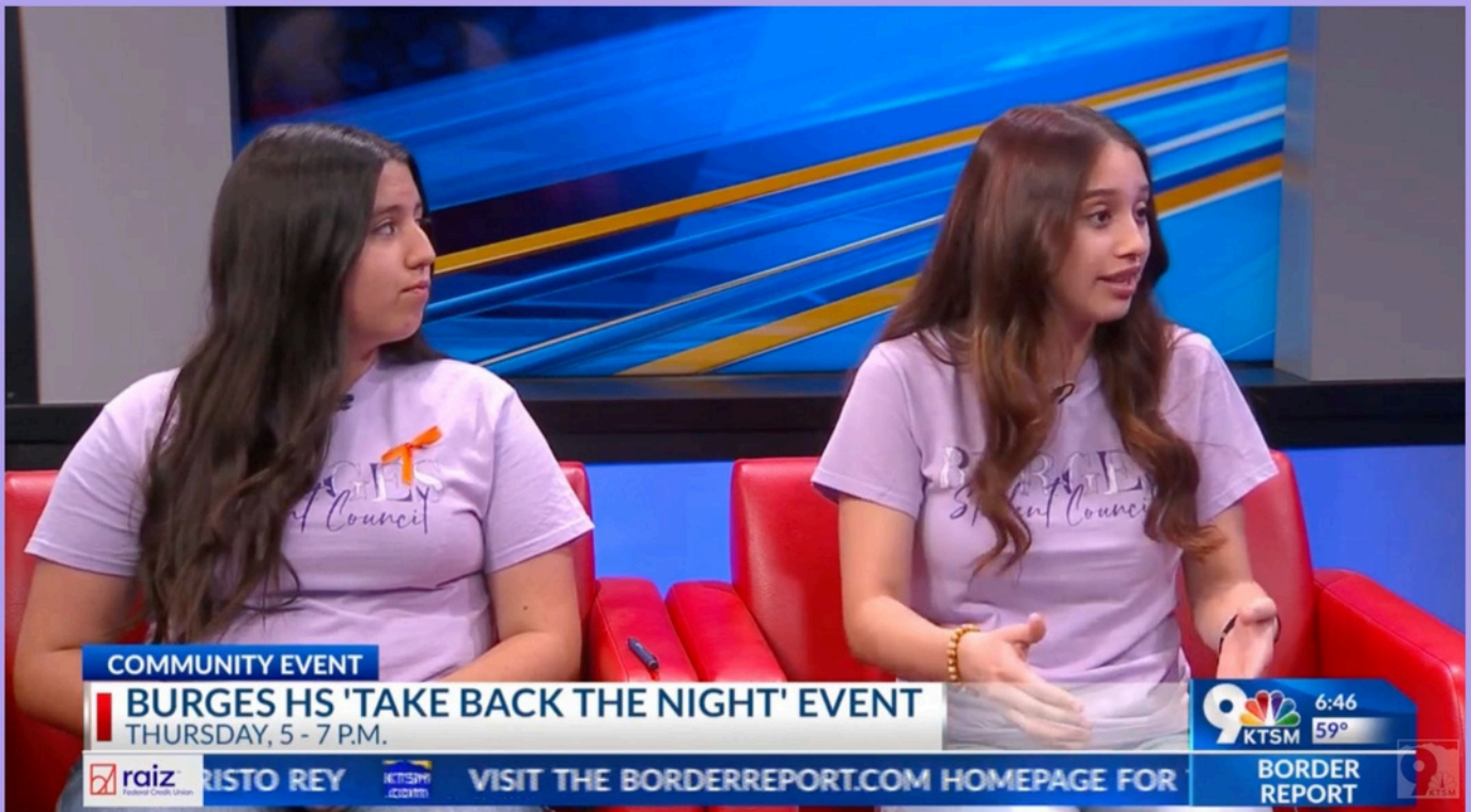
We had the chance to promote our event on local news channels and radio stations