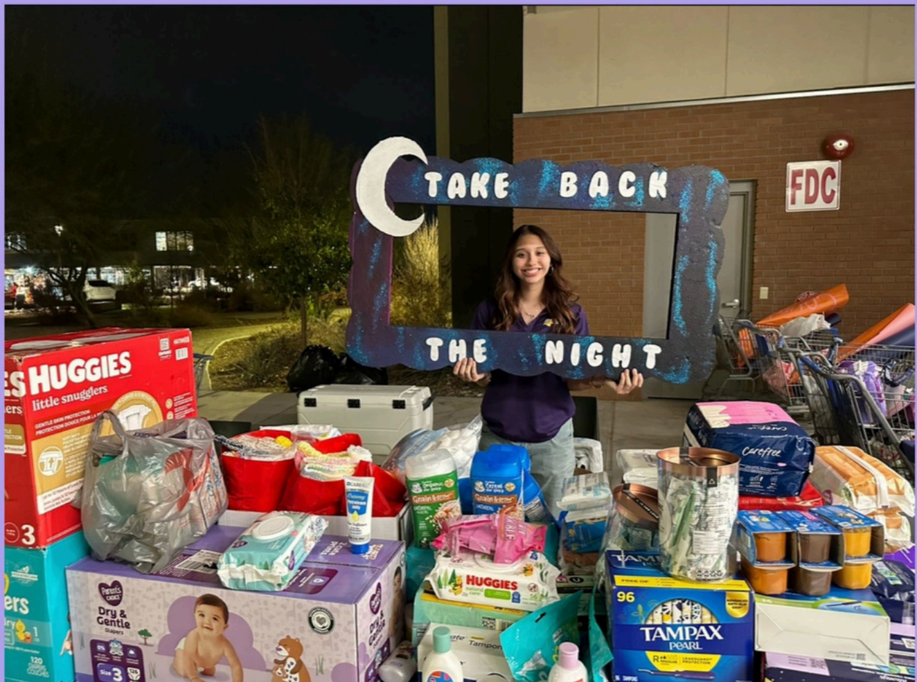
"Admission" for the event was donations of toiletries which were donated to one of our local shelters