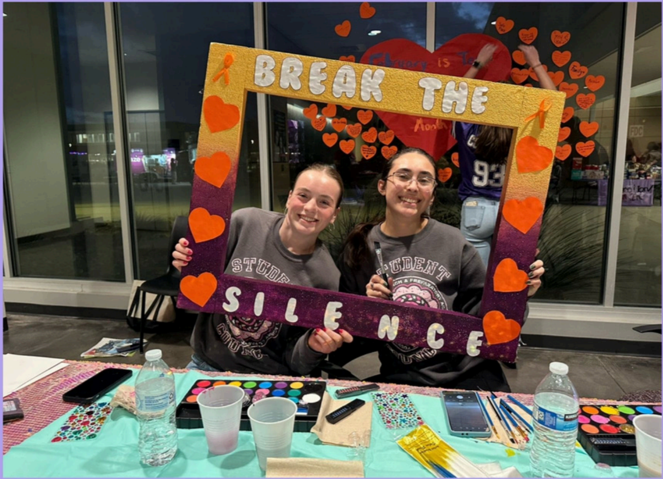
The Face Painting Booth manned by Young Women's Academy